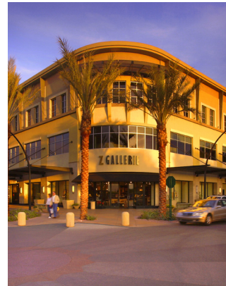
Kierland Commons, Phoenix/Scottsdale, AZ