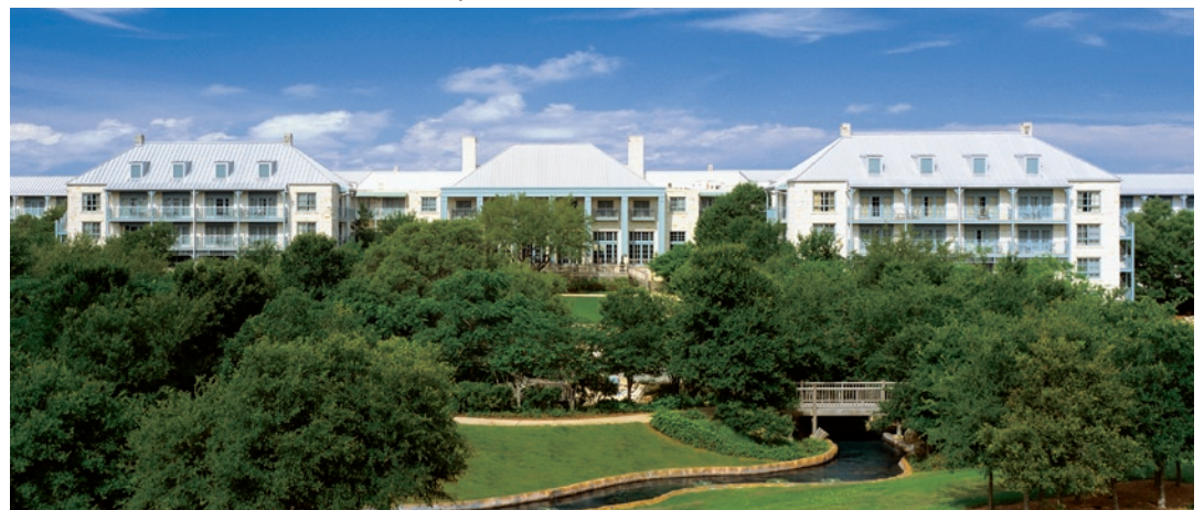
Hyatt Regency Hill Country Resort and Spa