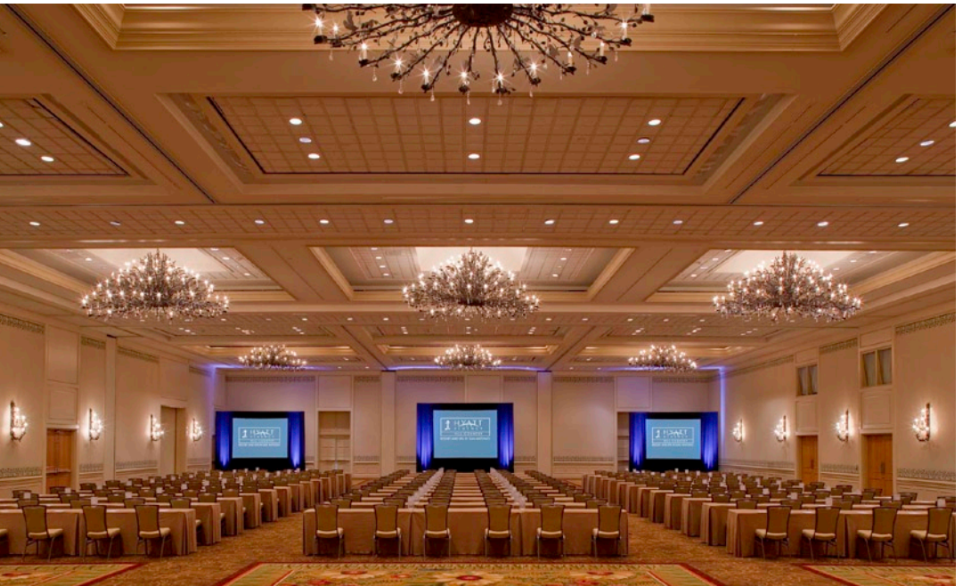
Hyatt Regency Hill Country Resort and Spa