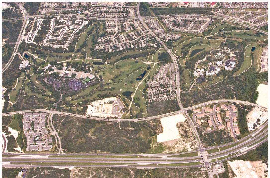
Hyatt Regency Hill Country Resort and Spa

On 303 acres of Texas ranch land, 20 minutes northwest of San Antonio International Airport; bounded on the north by Westover Hills Boulevard, on the east by Hunt Lane, on the south by Military Drive West and on the west by Rogers Road, the resort is accessed from a main entrance on Hyatt Resort Drive at State Highway 151 across from Sea World of Texas.