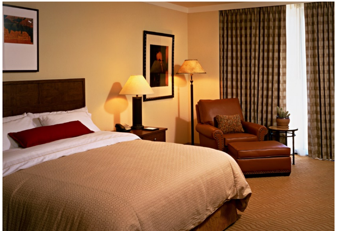
The Westin Kierland Resort & Spa