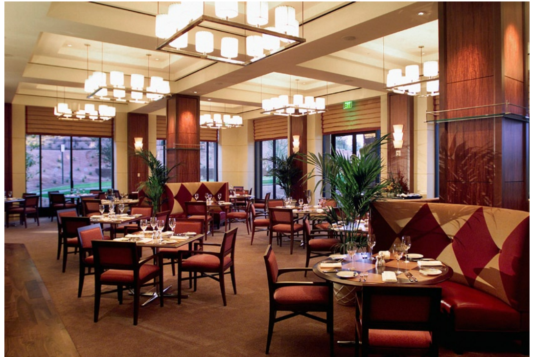
The Westin Kierland Resort & Spa

Current — Host Hotels & Resorts, Inc. of Bethesda, Maryland