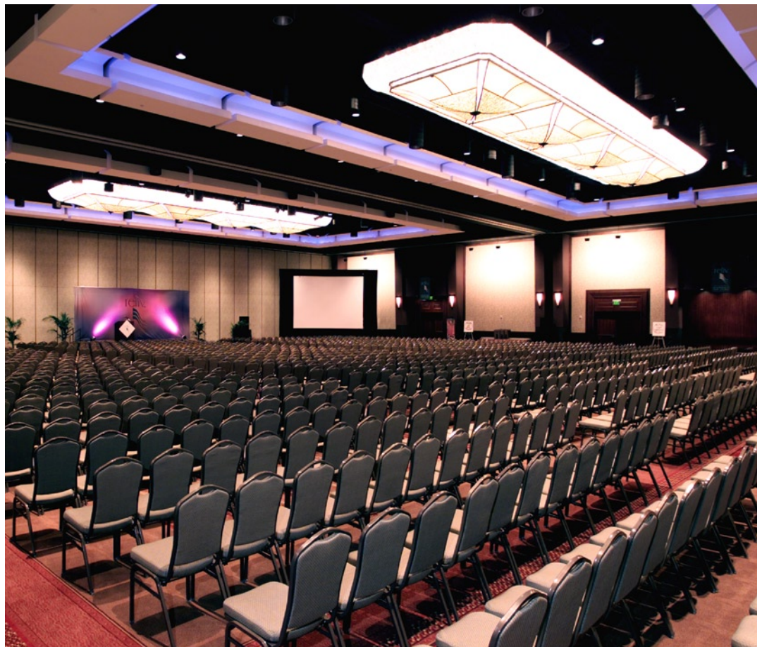
The Westin Kierland Resort & Spa

Within the 730-acre Kierland master-planned community along Scottsdale Road in northeast Phoenix. Approximately 20 minutes from historic Scottsdale; 30 minutes from downtown Phoenix; 30 minutes from Sky Harbor International Airport.