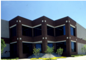
Park Place II